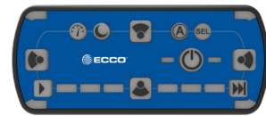
Advanced Controller with Safety Director Functions (Optional Accessory) EZ1202