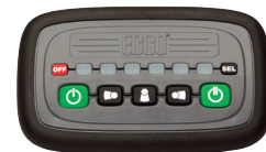
Basic Controller (Optional Accessory) EZ0006